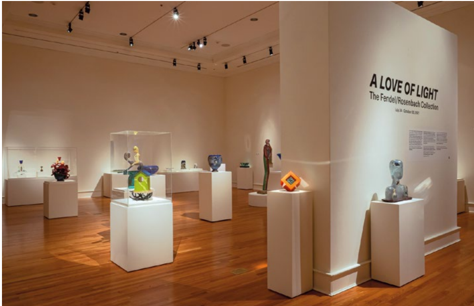
A Love of Light: The Fendel/Rosenbach Collection